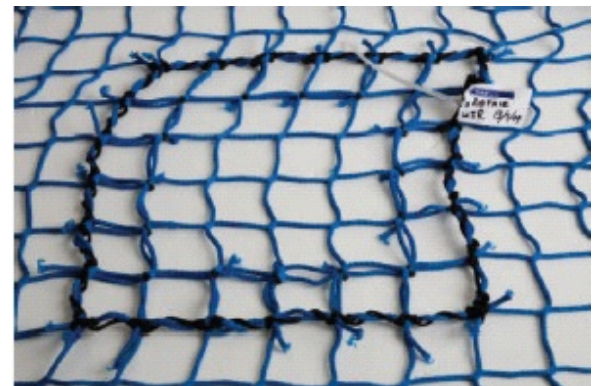
Figure 2. Repair patch attached by lacing repair twine through the perimeter meshes and using cable ties on the inside meshes