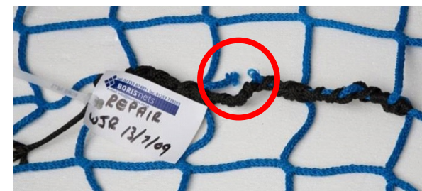
Figure 3. Single strand repair, highlighting the torn strand

For more information about FASET, contact: