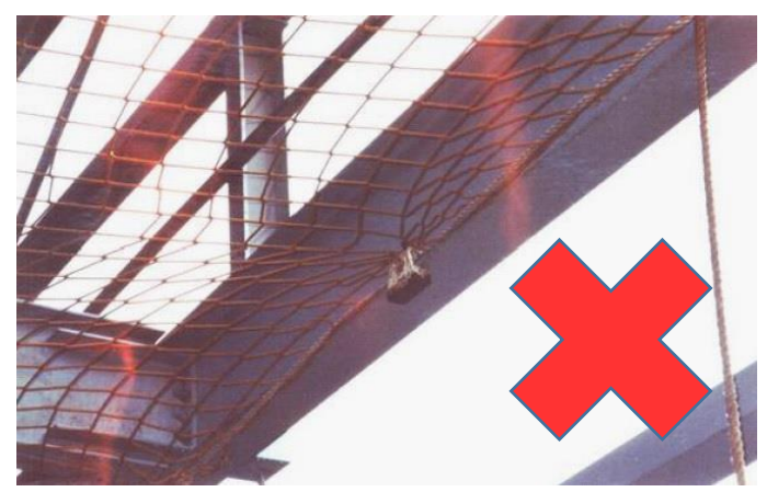
Figure 1. Incorrect attachment of a Safety Net

The practice of using single scaffold girder clamp - coupler or part of them to attach or hook a Safety Net to the bottom flange of a beam or similar structure is prohibited. Safety Nets must not be installed as shown in Figure 1.