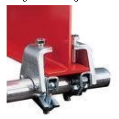
Figure 2. Correct use of a scaffold girder clamp