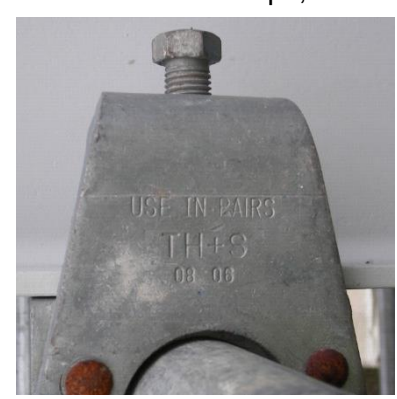
Figure 2. Correct use of a scaffold girder clamp

Scaffold girder clamps are designed to be used in pairs with a scaffold butt / tube attached between the two clamps, as shown in Figure 2 and Figure 3.