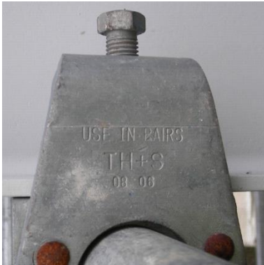
Figure 2. Correct use of a scaffold girder clamp

Scaffold girder clamps are designed to be used in pairs with a scaffold butt / tube attached between the two clamps, as shown in Figure 2 and Figure 3.