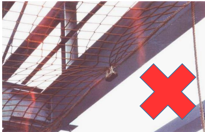
Figure 1. Incorrect attachment of a Safety Net

The practice of using single scaffold girder clamp - coupler or part of them to attach or hook a Safety Net to the bottom flange of a beam or similar structure is prohibited. Safety Nets must not be installed as shown in Figure 1.