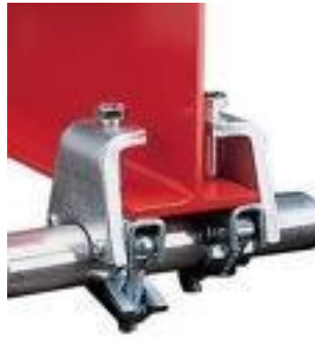
Figure 2. Correct use of a scaffold girder clamp